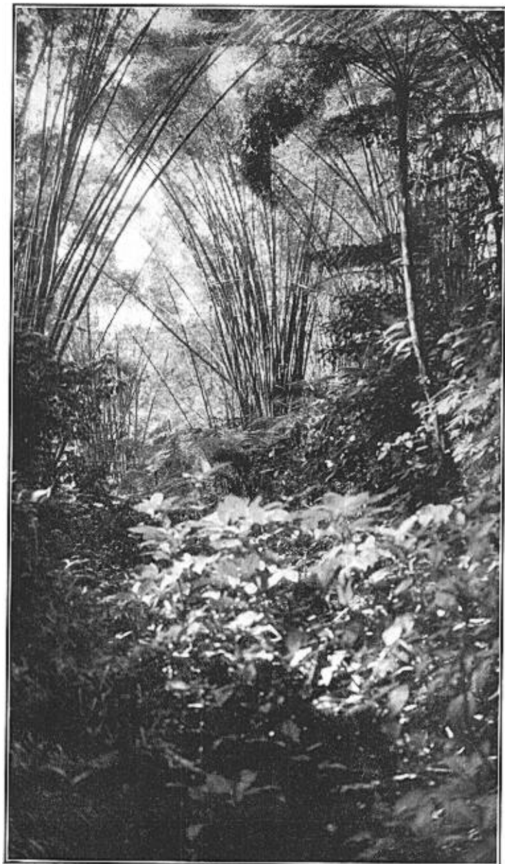
TYPICAL HAUNT OF THE SOLITAIRE IN MARTINIQUE.