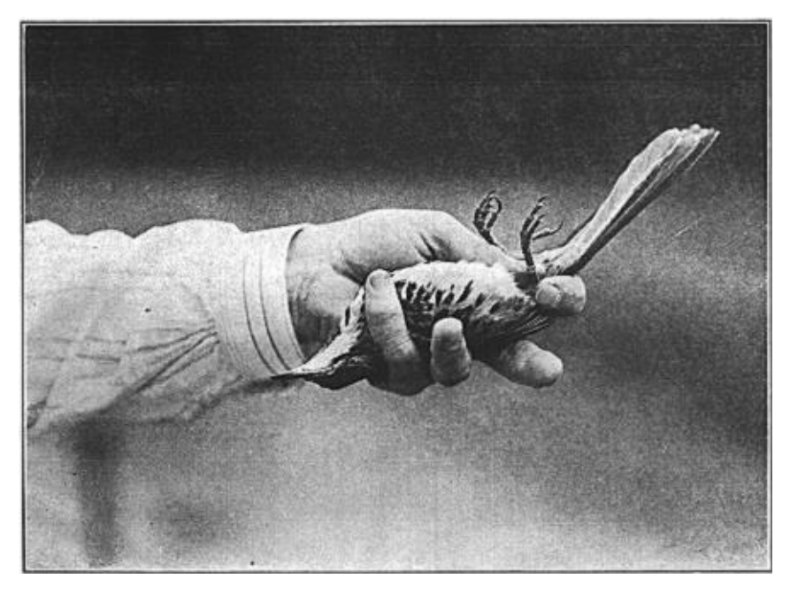
PHOTOGRAPHS FROM S. PRENTISS BALDWIN.