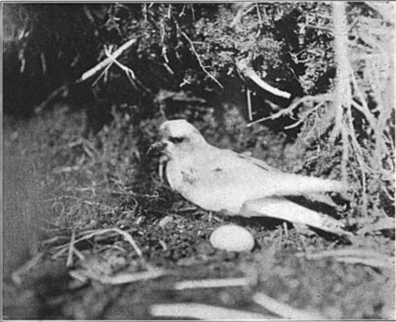
FORKED-TAILED PETREL ON NEST (EXCAVATED).