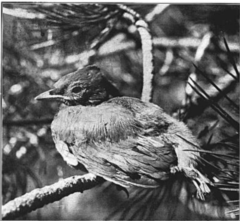
1. "NEST" AND EGGS OF RED-SHAFED FLICKER BUILT BETWEEN STUDDING OF WALL OF FRAME DWELLING. MOUNTAIN RAT'S NEST AT RIGHT.