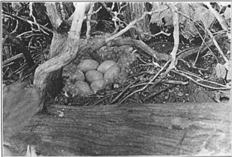
2. NEST AND EGGS OF RED-BREASTED MERGANSER.