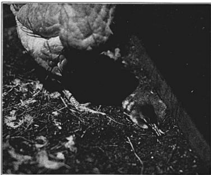
2. RED-BREASTED MERGANSER, THREE WEEKS OLD SWALLOWING A GRASSHOPPER.