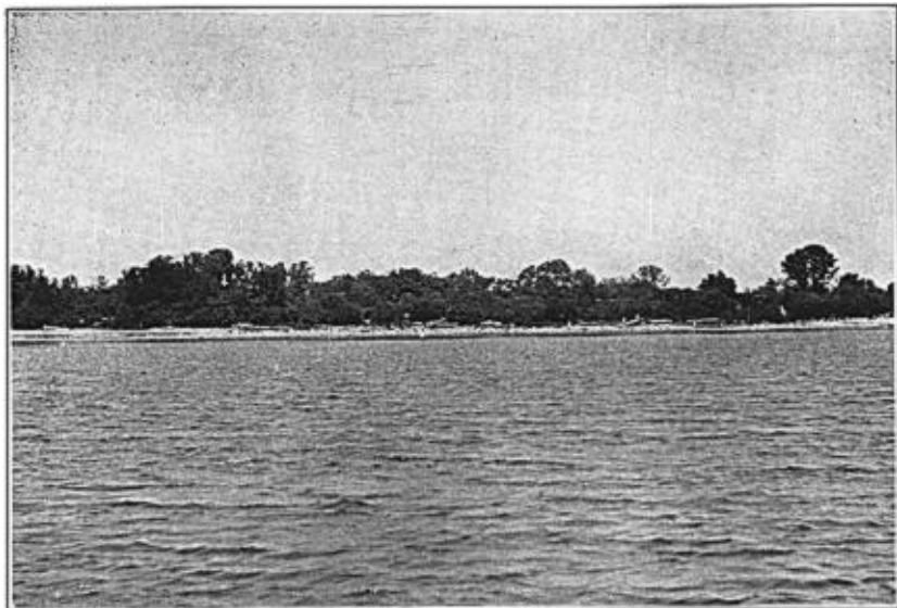
1. CHARACTERISTIC BREEDING HABITAT OF RED-BREASTED MERGANSER.