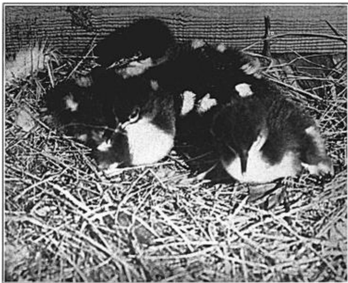
1. RED-BREASTED MERGANSERS, TWO DAYS OLD.