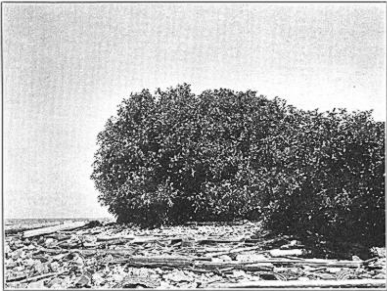
1. SITE OF RED-BREASTED MERGANSER'S NEST.