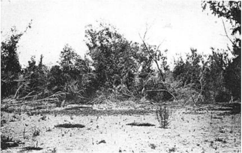
LAGOON IN THE COLORADO RIVER BOTTOMS NEAR NEEDLES, CALIFORNIA.