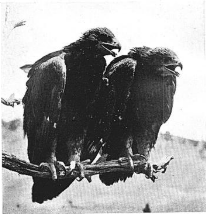
YOUNG GOLDEN EAGLES, ABOUT TWO MONTHS OLD.