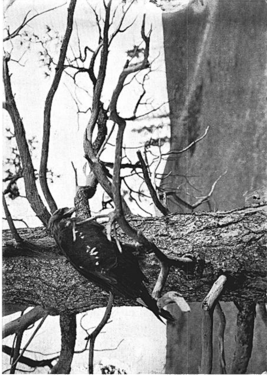
GOLDEN EAGLE IN PINE TREE LOOKING DOWN AT PHOTOGRAPHER.