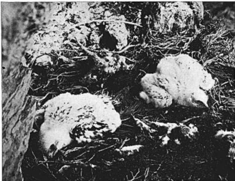
FIG. 2 EAGLETS, ONE MONTH OLD. A plucked Sharp-tailed Grouse on further side of nest.