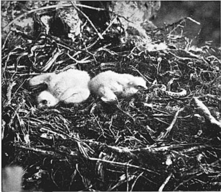
FIG. 1. EAGLETS, 14 DAYS OLD. Two bull snakes and part of jack-rabbit in the nest, to the right of young.