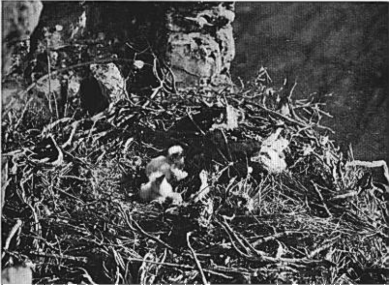
FIG. 2. GOLDEN EAGLE EYRIE. EAGLETS 2 DAYS OLD.