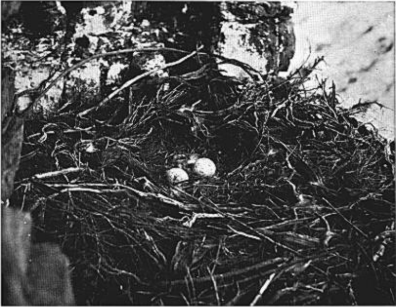
FIG. 1. GOLDEN EAGLE EYRIE. THE EGGS HATCHED IN 35 DAYS.