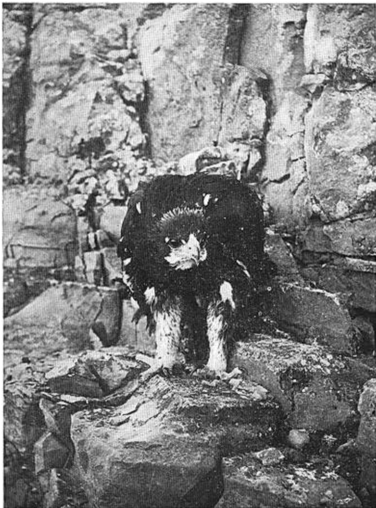
FEMALE EAGLET, TWO MONTHS OLD AND ABLE TO FLY.