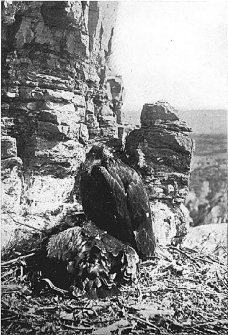
EAGLETS IN NEST, ONE MONTH AND 25 DAYS OLD. They would not face the sun.