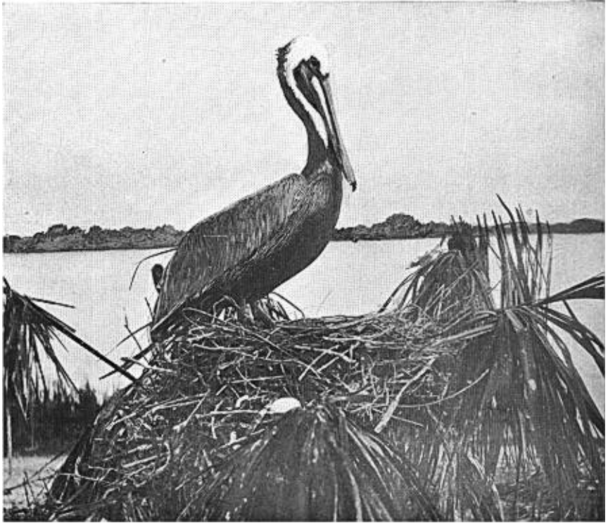
FIG. 1. BROWN PELICAN AND NEST IN YOUNG CABBAGE PALMETTO. The same nest, with a bird seated on it, is shown in the picture below.