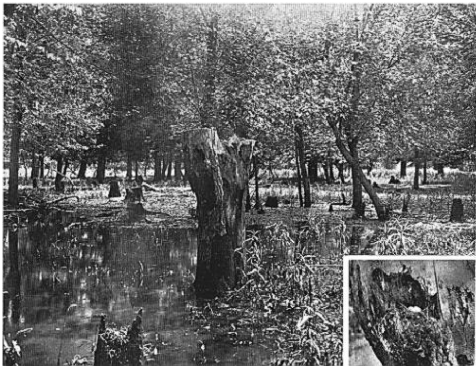
FIG. 2. PROTHONOTARY WARBLER. Nesting stump and characteristic environment. Lower right-hand corner, nest and eggs exposed in situ. Near Redwing