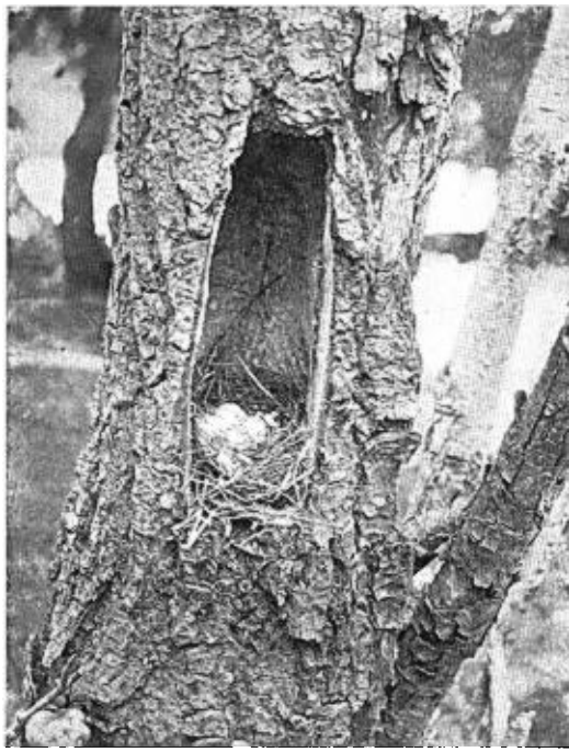
FIG. 3. NEST AND EGGS OF PROTHONOTARY WARBLER, exposed in situ. Houston Co., Minn.