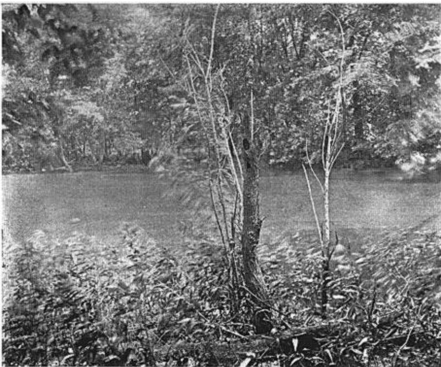
FIG. 1. NESTING PLACE OF PROTHONOTARY WARBLER. Near Reno, Hamilton Hamilton Co., Minn.