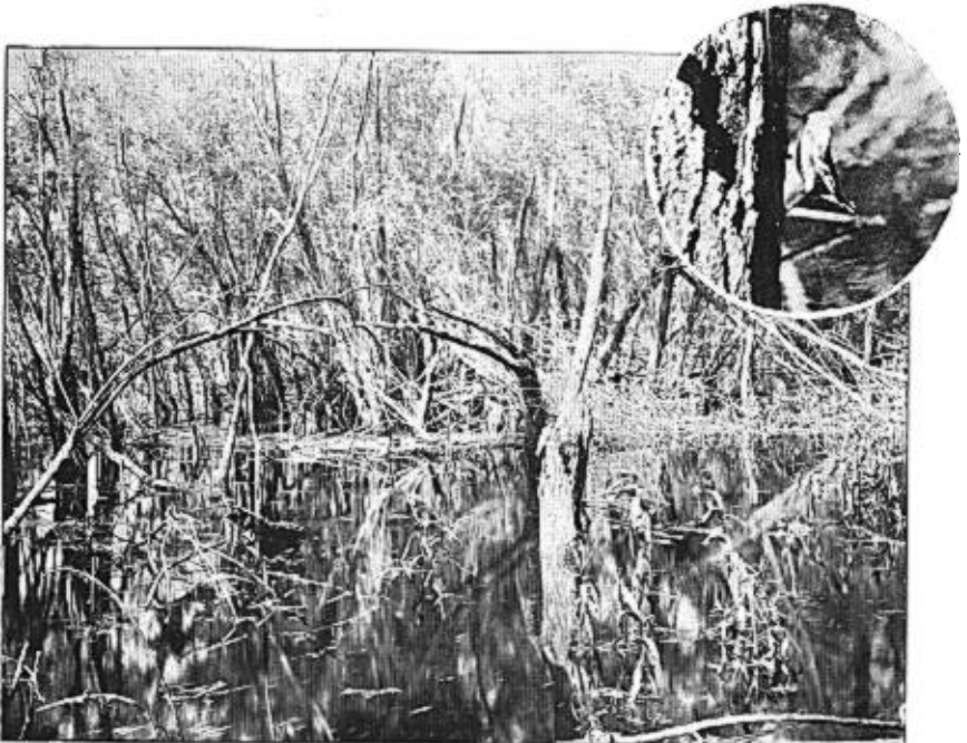
FIG. 4. CHARACTERISTIC RESORT OF PROTHONOTARY WARBLER. Nesting stub in foreground. Upper right-hand corner, male approaching