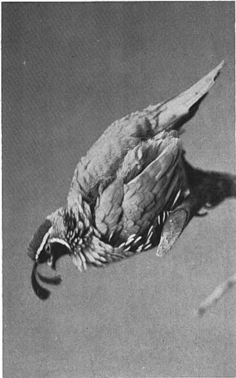
GAMBEL'S PARTRIDGE ( CALLIPEPLA GAMBELI ).