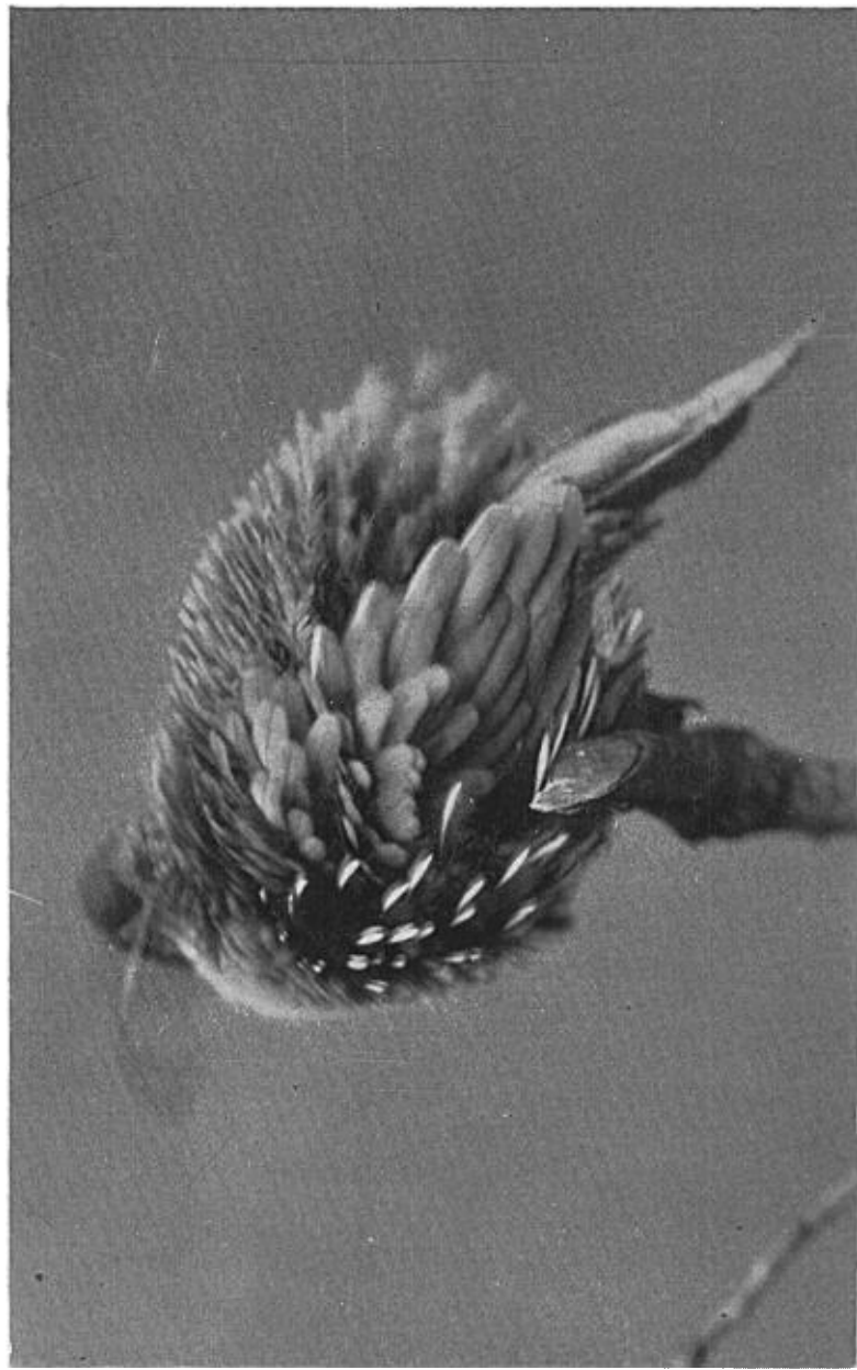
GAMBEL'S PARTRIDGE ( CALLIPEPLA GAMBELI ).

FROM A PHOTOGRAPH OF THE LIVE BIRD, IN ACT OF PREENING.