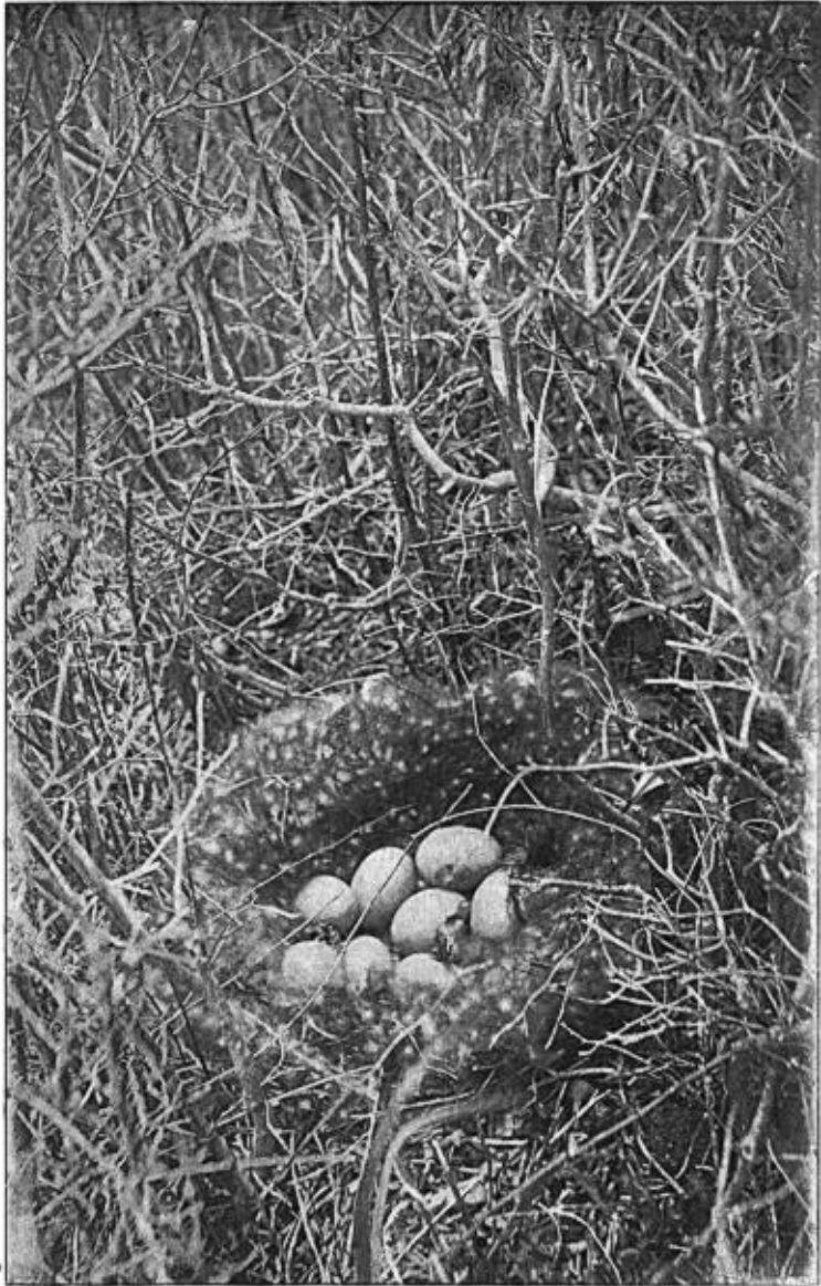
BLACK DUCK'S NEST, PLUM ISLAND, N. Y.