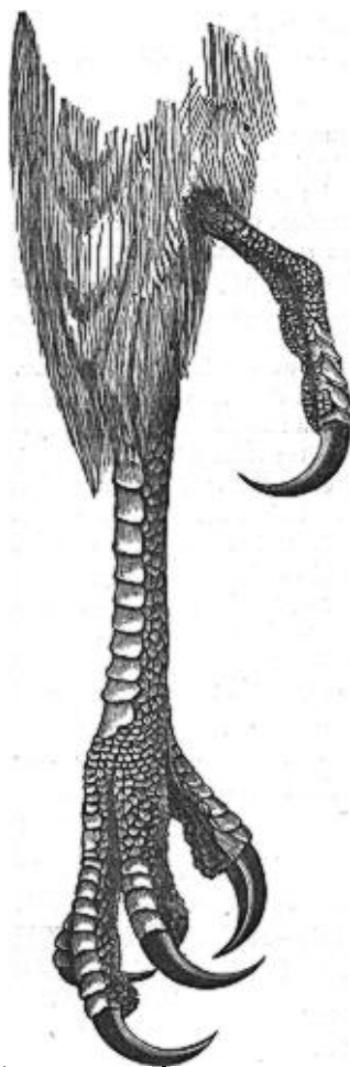
RIGHT LEG, INSIDE VIEW. NATURAL SIZE.