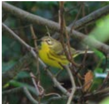
Prairie Warbler, Villa Angela State Park, 9/27/2009 Nancy Anderson

Three to four were counted at Villa Angela on 9/15 (NA); the same day Headlands had its peak of five (RH). The latest sighting was one seen on 10/11 at Headlands (RH).