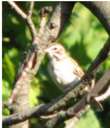
Lark Sparrow, Villa Angela State Park, 9/5/2009