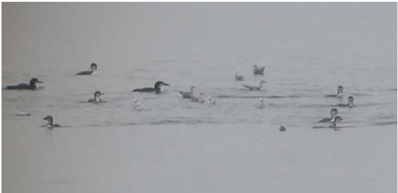
Loons and Gulls, Rocky River City Park (continued opposite)

Harlequin Duck. Single birds were observed from the Headlands Road lookout on 11/1, 11/3 and 11/5 (JT vide RH).