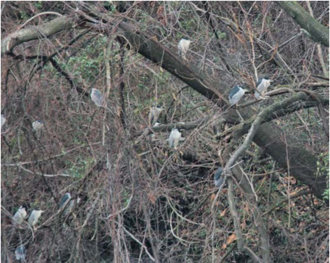
Black-crowned Night-Heron, Cleveland, 1/13/2008