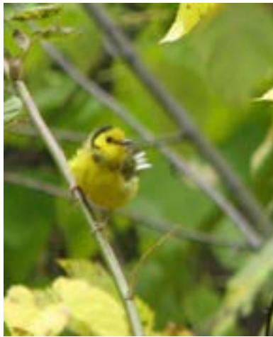
Hooded Warbler, Villa Angela State Park, 10/24/2009

Wilson's Warbler. Easily found at HBSP until the end of September; a high of eight were counted on 9/15 (RH). Several other area reports, including the season's latest of one on 10/5 at Ira Road (TMR) and one at VAWW on 10/16 (NA).