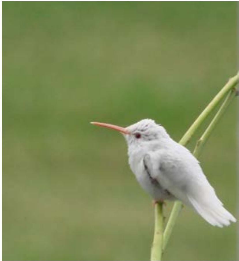
Albino Ruby-throated Hummingbird, Bainbridge, 9/7/2009

Hairy Woodpecker. On 9/10 there were two at Station Road (DAC). A five hour morning hike in the CVNP