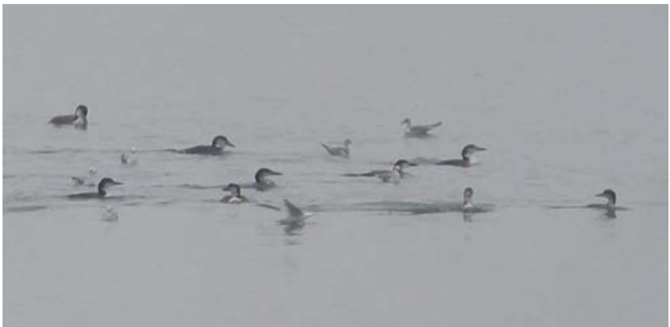
11/22/2009 Paula Lozano

Common Loon. Earliest reports came from HBSP with one on 10/12; peak numbers there totaled 25 on 10/16, 25 on 11/4 and a high of 106 on 11/12 (RH). As expected most occurrences fell mid-November onwards. At least fifty had been counted on 11/19 at Rocky River Park (PL, RF, AS) and as many as 91 again on 11/24 (PL);