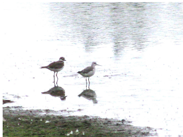
Red-necked Phalarope (left), 9-21-2008, and Wilson's Phalarope (with Killdeer), 9-26-2008, Lorain Harbor Impoundment