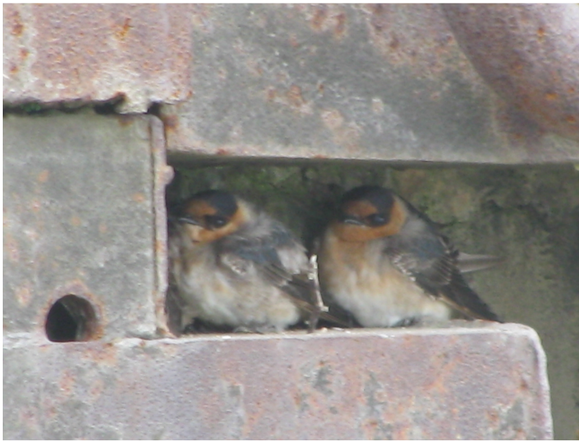
Cave Swallows, Bradstreet's Landing, Cuyahoga Co., 11-9-2008

Downy Woodpecker. Expected counts, highest was nine on both 9/20 and 11/17 at Ira Road (TMR).