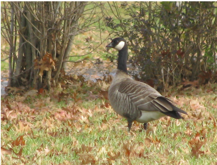
Cackling Goose, Whitehaven Cemetery, Cuyahoga Co., 11-7-2008

Canvasback. A single bird on 10/29 was Headlands' only report (RH).