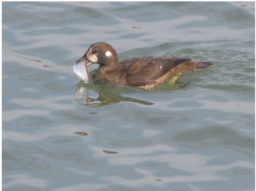
Harlequin Duck, East 72 nd Street, Cuyahoga Co., 11-27-2008