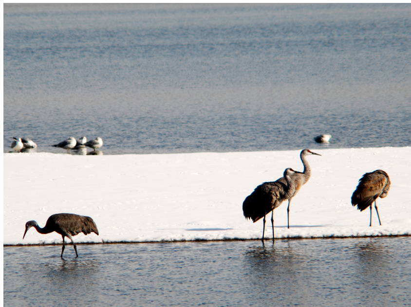
Sandhill Cranes, LaDue Reservoir, Geauga Co., 11-29-2008