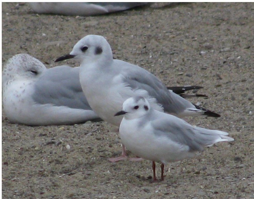
Front to back: Little Gull, Bonaparte's Gull and Ring-billed Gull, Headlands, Lake Co., 9-27-2008

Common Tern. Except for a single bird on 11/9, Headlands' sightings were all in September with a