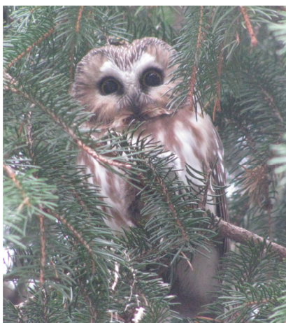
N. Saw-whet Owl, Dike 14, Cuyahoga Co., 11-30-2008

Northern Saw-whet Owl. On 11/30 this typically obliging bird allowed itself to be photographed at Dike 14 (GL).