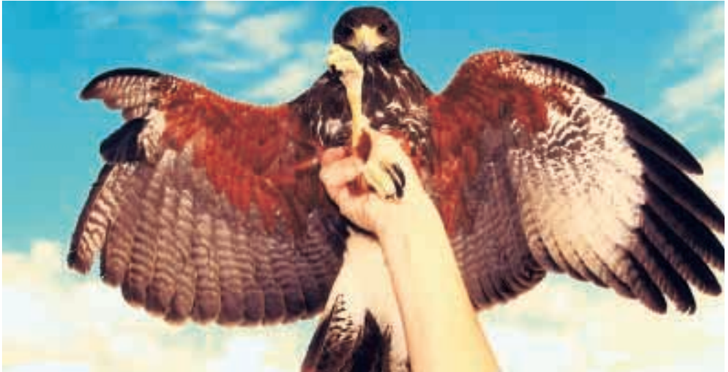
Figure 1: Front of immature female Harris' Hawk showing the missing end of the right wing. Dark feather at point of loss is an emerging adult primary feather. Note intact alula above emerging adult primary feather. The foot near the face of hawk is missing the hallux.

The authors have witnessed a falconer's adult Harris' Hawk and a fledgling peregrine falcon ( Falco peregrinus ) electrocuted by high voltage electric currents from landing on electrical transformers. In the case of the Harris' Hawk, the explosion from the hawk grounding out the transformer burned a large section of pri-