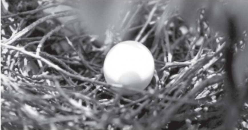
Figure 1: Nest and egg of Red-billed Pigeon.

(Baptista et al. 1997). We gathered clutch-size data on Red-billed Pigeons to determine the frequency of two egg clutches. Data were gathered from various sources including the literature (Brush 1998, Dickey and Van Rossem 1938, Land 1970, Monroe 1968, Oberholser 1974, Russell 1964, Russell and Monson 1998, Slud 1964, Skutch 1964), notes from Texas Parks and Wildlife biologists (G. Waggenerman pers. comm.), nest cards on file at the Western Foundation for Vertebrate Zoology and authors' field studies (Eitnrear and Aragon 2000, Breeden 2002). In all we documented 119 clutches (45 Mexico, 66 Texas, 1 El Salvador, 7 Costa Rica).