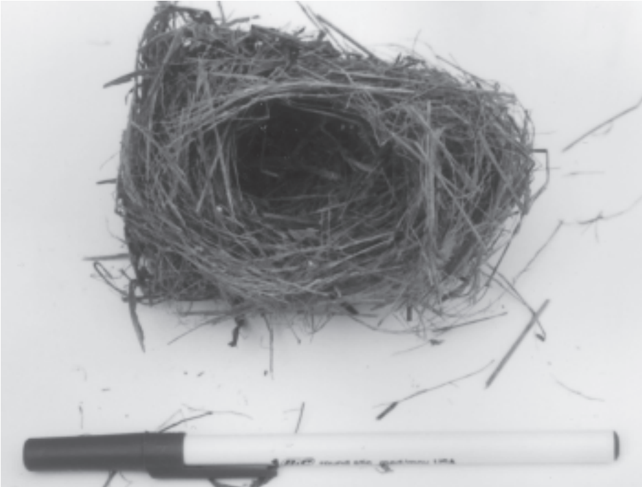
Figure 1: Nest of the Yellow-faced Grassquit. (Photo: J. Eitniear/TCWC No.2002-75).

mildly in the direction of the intruder, who retreats without necessity of conflict” (Skutch 1954: 39).