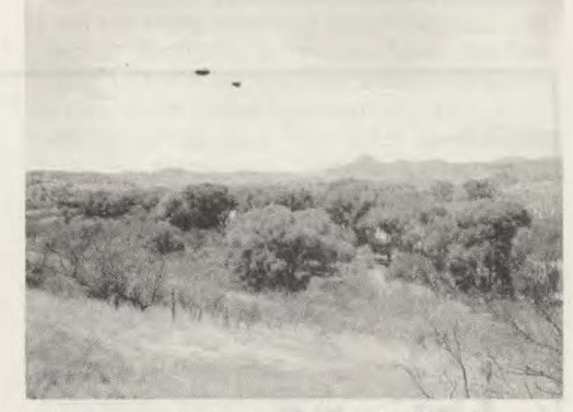
Creek bottom showing cottonwood-willow groves in Nature Conservancy Sanctuary.

On the Nature Conservancy Sanctuary (labelled by numerous markers, fenced to prevent grazing, and reached via Pennsylvania Avenue in Patagonia), trails lead through the ungrazed thickets from each of the metal pipe walk-throughs. Enter the