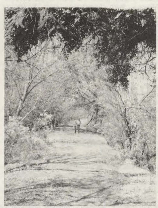
Old railroad grade trail across road from Roadside Rest.

Accomodations Motels at Nogales; one (new) motel at Patagonia. Restaurants at Nogales, Patagonia, Lake Patagonia, Sonoita. Groceries, gasoline at Patagonia, Sonoita, Nogales. Fee campground with facilities at Lake Patagonia. Free camping permitted at Sonoita Creek Ranch along creek; no facilities.