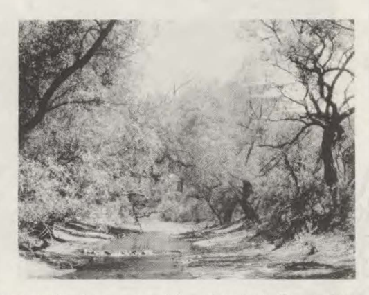
Sonoita Creek across road from Roadside Rest and 1/4 mile upstream.

Birdwatching The area is best known for its great number of breeding birds, some of which are typically Mexican species. Park at the Roadside Rest (highway marker 151/2 miles NE of Nogales) and walk along the trail on the far side of the creek ¼ mile upstream and ¼ mile downstream from the Roadside Rest. The old railroad grade is an easy trail to follow along most of the creek. During the peak of the breeding season in May and June, check the sycamore trees near the Roadside Rest for the pendulous nests of the Rosethroated Becard. Also nesting in the same sycamores are Cassin's and Thick-billed Kingbirds, Ash-throated, Wied's Crested, Olivaceous, and Vermilion Flycatchers. For nesting Beardless Flycatchers check old tent caterpillar webs in willow trees at edge of creek. During May and June flocks of Bandtailed Pigeons feed on elderberries near the Roadside Rest. Varied Buntings nest near the Roadside Rest Area in the thorn scrub on the canyon slopes, where Lucy's Warbler, Blue Grosbeak, Rufous-crowned and Blackthroated Sparrows and the very rare Fivestriped Sparrow and Black-capped Gnatcatcher also occur. In April the slopes near the Roadside Rest have flowering Anisacanthus which supports a good number of nesting Costa's and Broad-billed Hummingbirds. The steep rock slopes near the Roadside Rest are good spots for Cañon and Rock Wrens and White-throated Swifts.