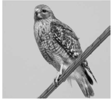
This Red-shouldered Hawk was at East Fork.

A four-person CBC team found nine in their 30 miles of travel in Brown on 02 Jan. (72 counties)