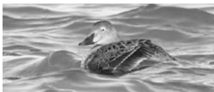
A surprise visitor to Lake Erie, at Sims Park, Cuyahoga, on 05 Dec.