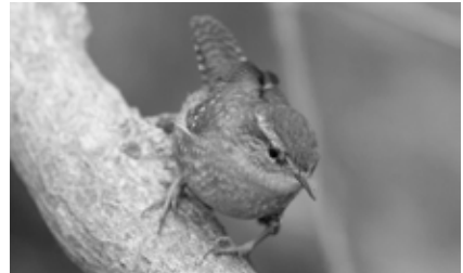
This close-up view of a Winter Wren was taken on 15 Dec at Hills and Dales MP, Montgomery.

Sites in Delaware , Lucas (2), and Ross each hosted three. (46 counties)