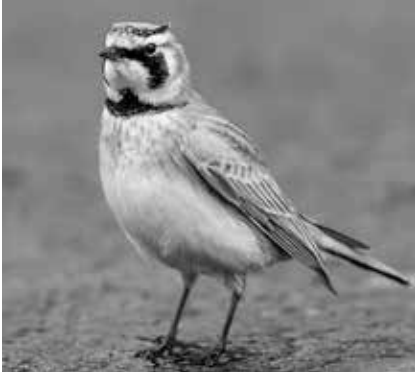
There is no doubt about how the Horned Lark got its name at Heritage Oak Park, Warren, on 06 Feb.