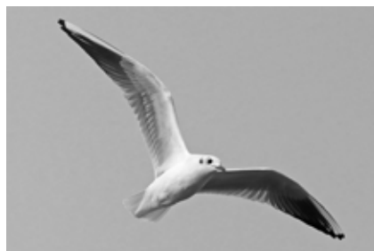
A Black-headed Gull was caught in flight at Wendy Park on 01 Jan.

One spent from 26 Dec to 16 Jan in the Cleveland area; many observers posted photos or descriptions but none provided a formal report for the OBRC. The OBRC has at least one formal report and many internet reports from Lake .