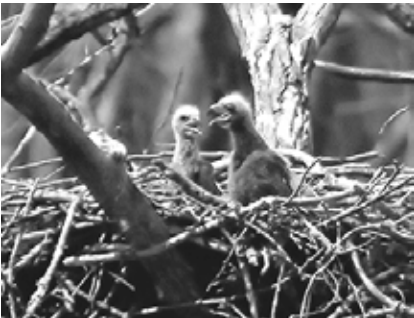
Tom Fishburn chronicled activity at this Bald Eagle nest in the Rocky River Reservation, Cuyahoga , with this view of the nestlings calling hungrily for a meal on 03 May.

A Biggest Week trip to Winous Point on 10 May yielded 50. Kent Miller saw the most away from Lake Erie, 21 on the ice of Berlin Lake on 25 Mar. (78 counties)