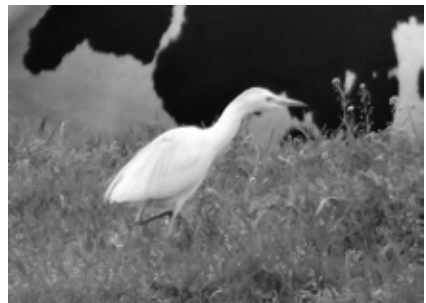
This Cattle Egret posed in front of a perfectly appropriate bovine background for Su Snyder on 12 May in Erie.

Up to four were reported in Lucas , Sandusky , and Wyandot , but the OBRC has only what it could collect from the internet for any of them.