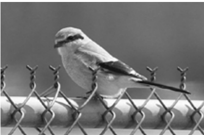
Photographer Ron Sempier focused on this cooperative Northern Shrike on 24 Mar at Big Island.

Irina Shulgina saw the last of these winter visitors, at Killdeer on 01 Apr. All of the sightings, in 13 counties, were of single birds.