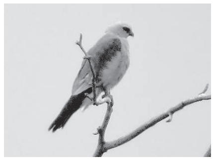
Cory Chiappone spotted a Mississppi Kite as it circled the lake at Holden Arboretum, Lake , on 04 July, obtaining great documentation photos when it perched on a snag

The OBRC has reports, some of them woefully thin on detail, from Hamilton , Lake , and Trumbull .