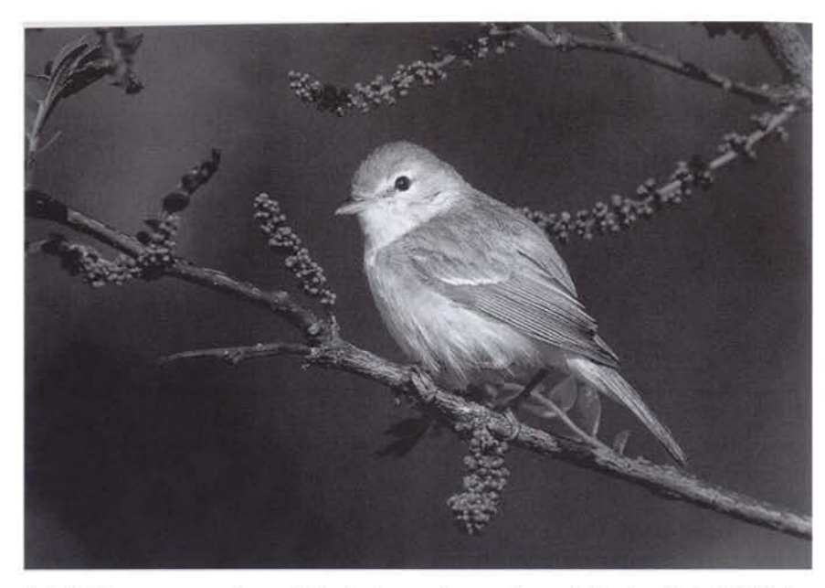
A Bell's Vireo, our rarest and most diminutive vireo species, was.

have been increasing in the park since 1995.