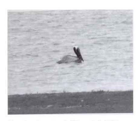
No major storms preceded the arrival of this Brown Pelican at Buck Creek State Park in Clark County; this individual apparently appeared under its own terms and departed in the same fashion on 09 May 2008. Only a handful of records exist for the Buckeye State.