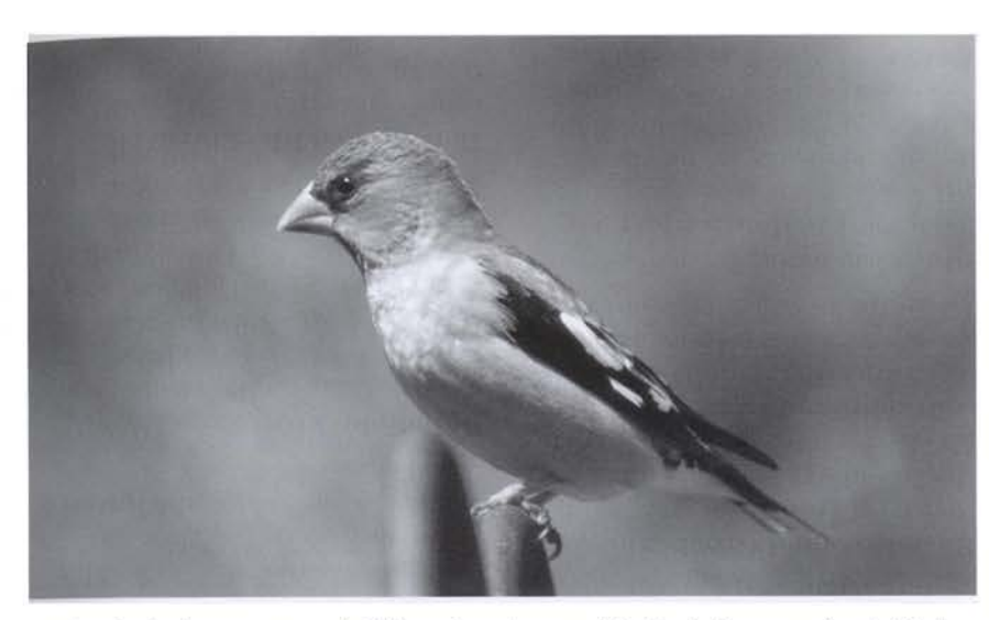
Evening Grosbeaks are uncommon in Ohio any time of year, and this female that appeared at the Black Swamp Bird Observatory's feeders by Ottawa National Wildlife Refuge on 04 May 2008 was a real surprise.