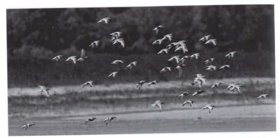
This photograph, capturing 47 Red Knots (count them!), represents Ohio's fourth highest count for this species. Taken 24 May 2008 at Big Island Wildlife Area in Marion County.