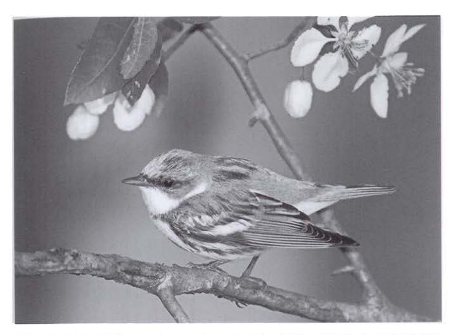
This male Cerulean Warbler came down from the canopy to pose for Brian Zwiebel's lens at Zaleski State Forest in Vinton County on 05 May 2008.

Black-and-white Warbler: First appearances nicely progressed from south to north: one was at Shawnee Lookout 30 Mar (Frank Frick), four at Shawnee SF 07 Apr (Robert