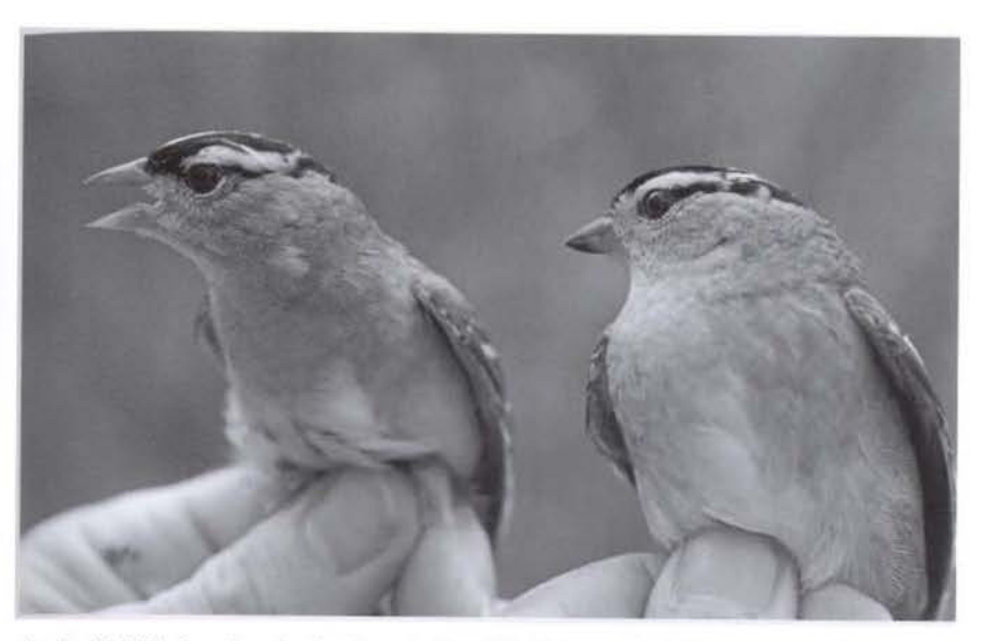
Another highlight from the spring banding activities of Black Swamp Bird Observatory was this opportunity to compare two subspecies of White-crowned Sparrow. The Gambel's subspecies (Zonotrichia leucophrys gambelii; right) breeds in the high Arctic west of Hudson Bay and into Alaska, and has pale lores. Most White-crowned Sparrows seen in Ohio are of the nominate subspecies (Zonotrichia leucophrys leucophrys; left), coming from northeastern or north-central Canada or the Rocky Mountains, and have black lores. Photograph from Navarre Marsh by Mark Shieldcastle.

Swamp Sparrow: Fifty at Hueston Woods SP, Butler/Preble , 22 Mar