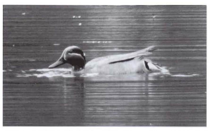
An individual of the Eurasian subspecies of Green-winged Teal (known as 'Common Teal' throughout much of the world) was found consorting with typical American birds at Station Road in Cuyahoga Valley National Park (Cuyahoga County).