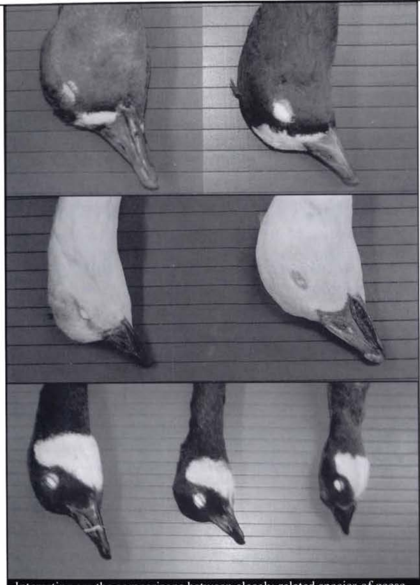
Interesting are the comparisons between closely-related species of geese. There are many parallels in morphology. Above are in #1 a greater white-fronted goose Anser albifrons, and a lesser white-fronted goose Anser erythropus. The latter species is globally endangered, but the specimen is nonetheless from Ohio. In #2 are a Ross's goose Chen rossii and a snow goose Chen caerulescens. In #3 are on the left a typical Branta canadensis maxima, the large local nonmigratory giant Canada goose; in the middle Branta canadensis parvipes, the lesser Canada goose; and on the right, Branta hutchinsii hutchinsii, the subspecies of cackling goose that occurs in Ohio.