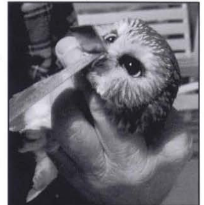
A variety of measurements are recorded for each owl captured at Buzzard's Roost including bill length.

W.E. Saunders (1907) gives a haunting description of a snowstorm on 10 October 1906 that dumped over a foot of snow near the southeast corner of