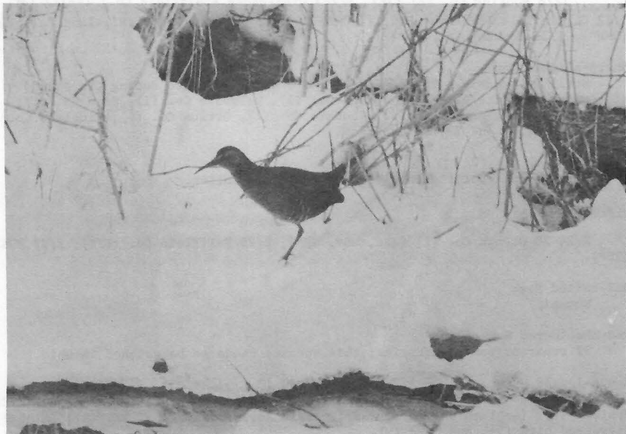
Virginia rail at Summit County, photographed by Edwin Pierce and reproduced by Gary Herbst.

12/6 Hocking Co. (JC), 12/28 Ashland Co. (JHr), 1/3 Clearcreek (JC, JF), 1/21 Cuyahoga Co. (TL), 1/25 Ft. Hill SM (MNN), 1/31 Chardon (EF), 2/7 Chardon (7) (EF), 2/8 Hocking Co. (JC).