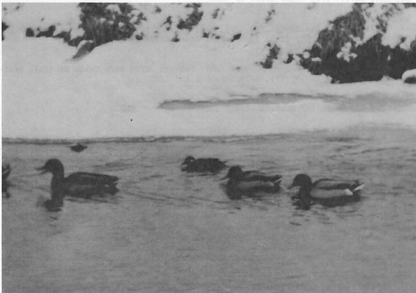
Harlequin duck at Springfield.

12/7 Sandusky Bay (7) (AT), 12/13 Sandusky Bay (9) (JP, 1/13 Lorain (JP).