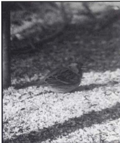
This photo, taken during Feb 1972 at Sheldon's Folly, documents the appearance of the Harris's sparrow there