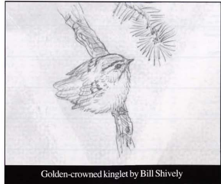
Golden-crowned kinglet by Bill Shively

The numbered circles on the map correspond to the numbers in parentheses that follow the names of the counts in the tabular report.