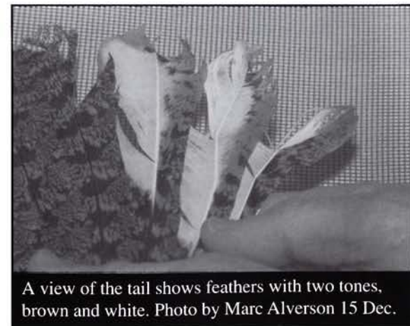
A view of the tail shows feathers with two tones, brown and white. 15 Dec.