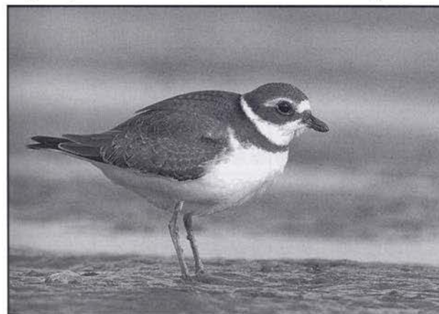
Semipalmated plovers, like this 6 Sept. individual, are regular spring and fall up-close visitors.

sound and sight of a peregrine stooping on a juvenal Hudsonian godwit, a black-necked stilt foraging in snow flurries, 43 American golden-plovers arriving in one fell swoop, American avocets and willets, whimbrels and red knots, and 28 striking adult ruddy turnstones—in fall! Buff-breasted sandpipers from the west have put on yearly cameos here in easternmost Ohio. Long-distance purple sandpipers,