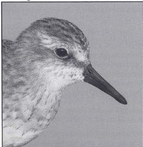
This semipalmated sandpiper is typical of some of the in-your-face views of shorebirds available at Conneaut.

On my third visit came nirvana. I drove up within feet of a molting adult Hudsonian godwit as it picked at washed-up plant material. Eventually it flew off, giving a low call. I began