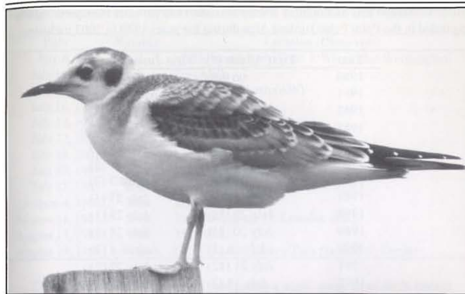
Juvenal Bonaparte's gull at Sturgeon Creek, Ontario, on 2 August 1987.

Every year since 1980 I have made an attempt at Point Pelee to find and record the first adult and juvenal fall migrants. Over the years the arrival dates of both age classes has been relatively consistent, as detailed in Table 1. Adult birds have been detected on dates ranging from 6 July (2001) to 30 July (2000), a span of 25 days. The first juveniles have been detected on dates ranging from 20 July (1998) to 9 August (1983), a span of only 21 days. It is perhaps more than coincidence that the earliest recorded date for adult birds (6 July in 2001) was immediately after one or