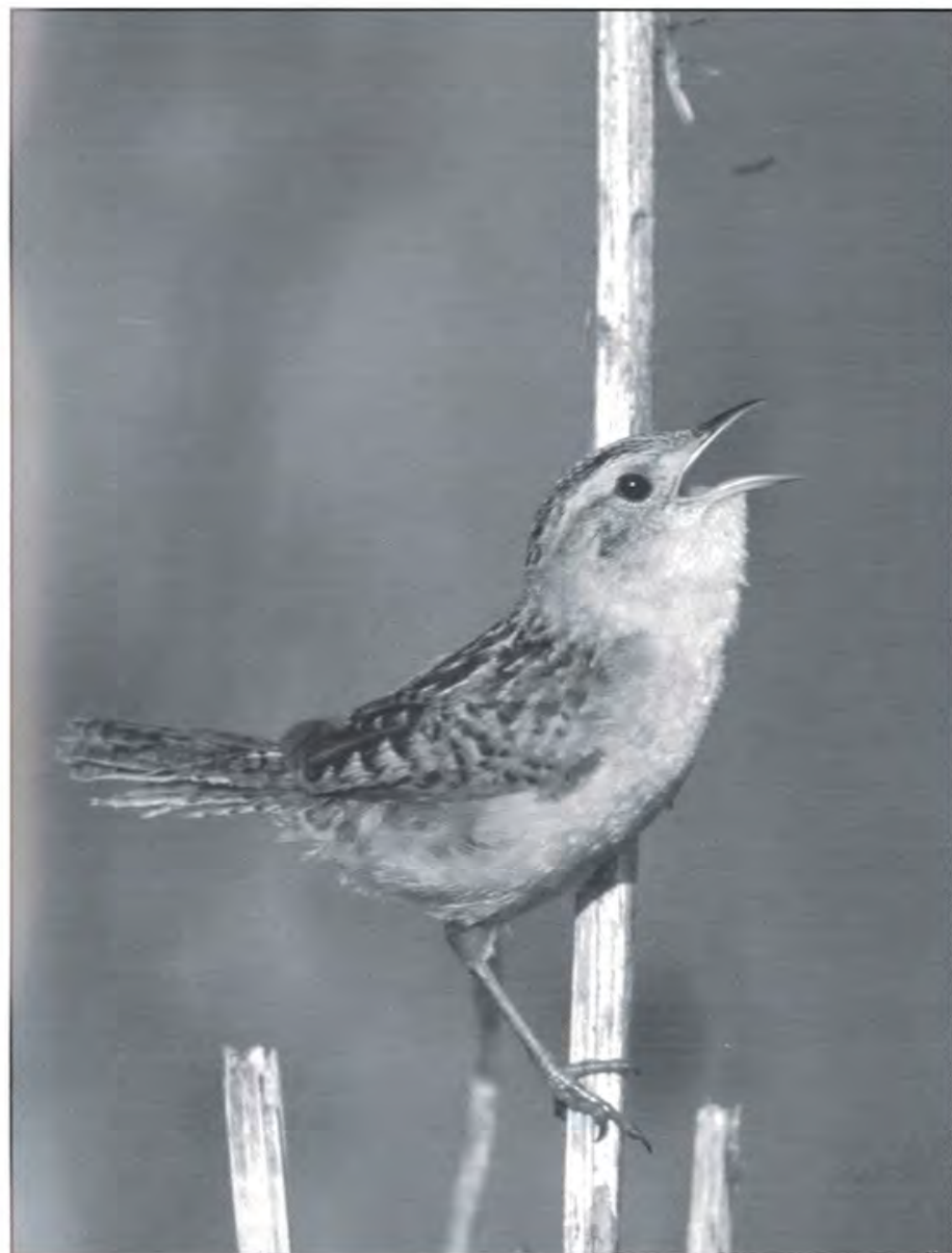
This singing sedge wren was photographed in Butler County's Voice of America Park in July 2003.