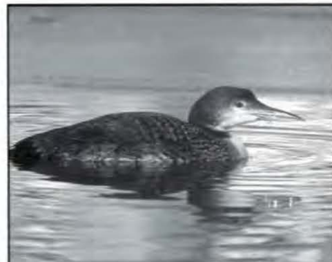
Nearly ice-bound in Cuyahoga County, this common loon was rescued and later released in Lake Erie. on 11 January 2003.