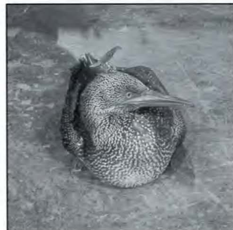
This first-year northern gannet was found in an Ashland County field on 4 December 2002. It was taken to a rehab center, but died six days later.