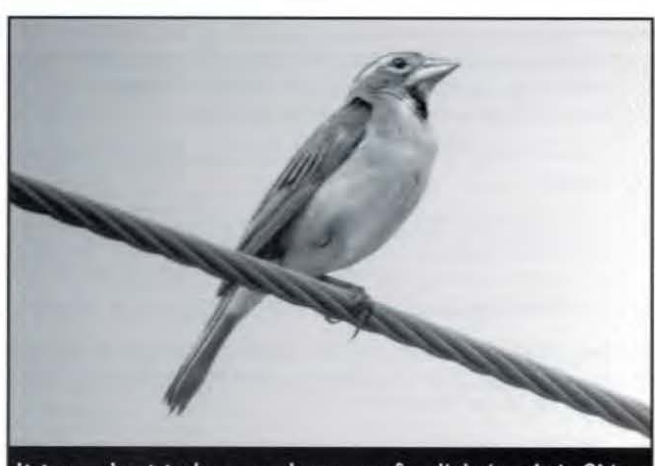
It turned out to be a good summer for dickcissels in Ohio. This male was digiscoped in Montgomery County on 24 July 2002.