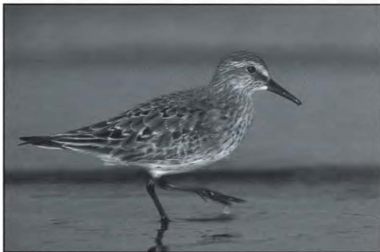
This white-rumped sandpiper was photographed on 1 October 2001 at Conneaut Harbor in Ashtabula County.