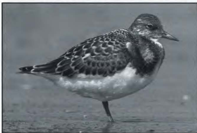
Ruddy turnstones were not widely reported this season. This one was present on 11 September 2001 at Conneaut Harbor in Ashtabula County.