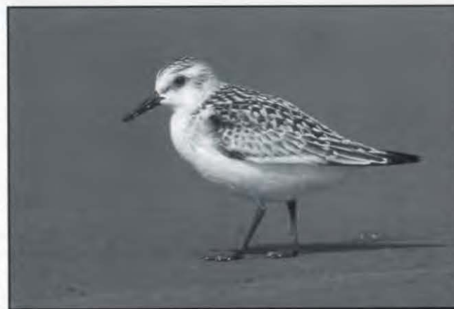
Autumn sanderlings always provide a nice contrast. This one was present at Conneaut Harbor in Ashtabula County on 11 September 2001.

Ruddy Turnstone: Not a good showing, with only 19 birds reported. The high count was four, at the CCE on 9 Aug ( V. Fazio ). The last two sightings were inland, with one at Findlay Res on 18 Sept ( B. Hardesty ) and another at Grand Lk St Marys on 30 Sept ( J. Ruedisueli ).