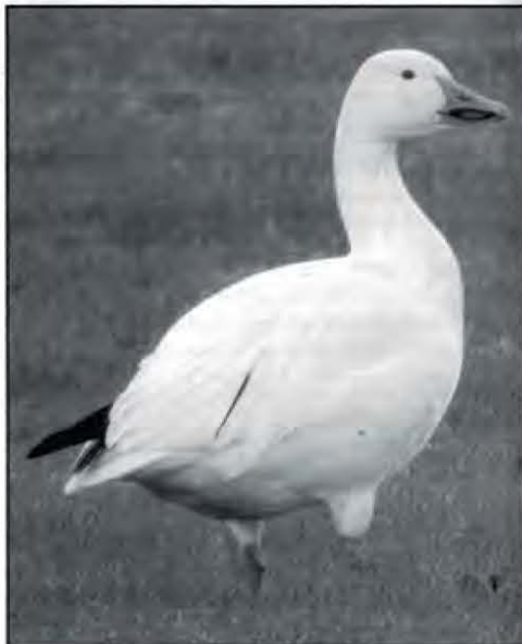
An adult white morph snow goose occupied a residential lawn near Clear Fork Reservoir in Richland County on 3 November 2001.

Gadwall: First reported by the ONWRC, with 31 on 2 Sept, where 3400 were present on 27 Oct (J. Pogacnik) and 1898 on 4 Nov (ONWRC). Persisted through the period in robust numbers, with 24 Nov counts of 300 at Ottawa (Pogacnik) and 144 at Lk Rockwell, Portage (L. Rosche).