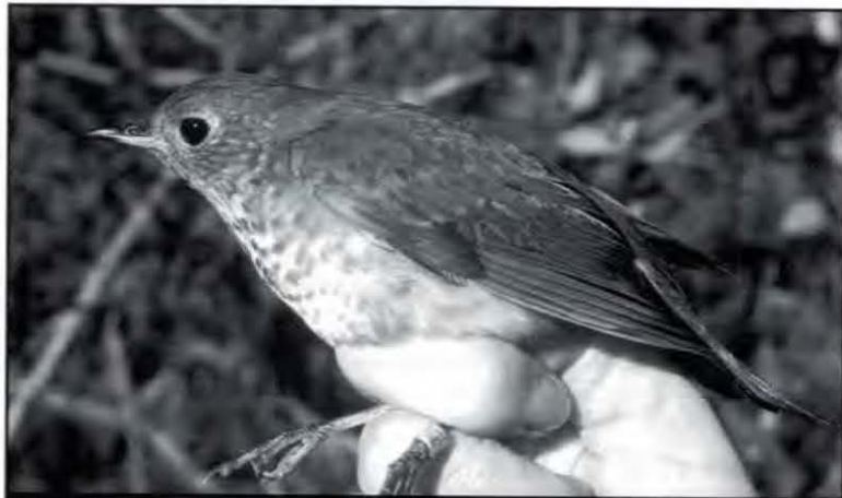
If accepted, this Bicknell's thrush would be a first Ohio record. It was banded and photographed at Navarre Marsh in Lucas County on 28 October 2001.