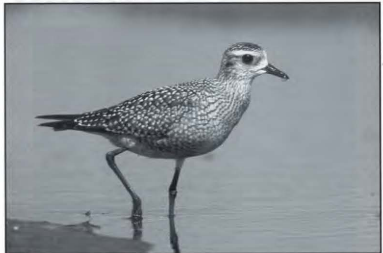
This American golden-plover posed at Conneaut Harbor in Ashtabula County on 11 September 2001.