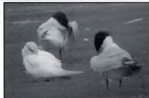
This leucistic Caspian tern was photographed at Ottawa National Wildlife Refuge in Lucas County on 23 August 2001.