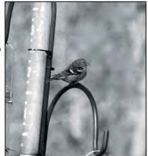
This female white-winged crossbill was the first to arrive in Ohio this season. It was photographed in Clermont County on 27 October 2001.