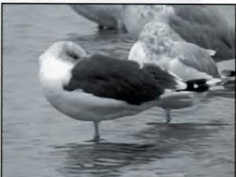
This lesser black-backed gull was caught snoozing at Huron Harbor in Erie County on 18 November 2001.

Black Tern: Like last fall, nearly sixty birds reported, nearly all away from Lk Erie. Over 20 were at Winton Woods, Hamilton , on 6 Aug ( B. Leaman ) for the high count. The last were at Pipe Ck WA and Sheldon Marsh SNP on 26 Aug ( J. Brumfield ).