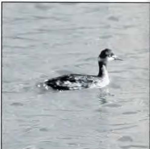
To the delight of many, this eared grebe spent several October days along the Cedar Point Chaussee in Erie County.