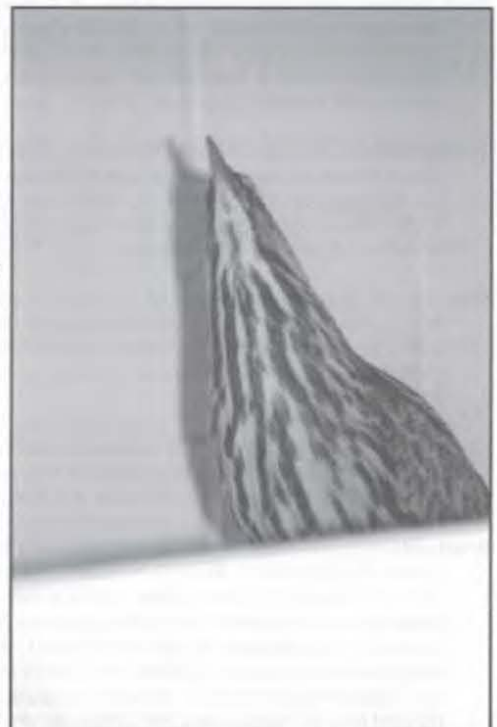
Here is a close-up view of the American bittern found in a Port of Cleveland, Cuyahoga Co., warehouse restroom. on 21 September 2000.

Black-crowned Night-Heron: Reports of small numbers were made across the state in Sept and Oct, the largest only 32 on 17 Sept at Magee ( H&S Hiris ). Nov reports included two at Turning Pt Isl on the 5 th ( R. Harlan , S. Wagner ), two at EHSP on the 26 th , two at Cleveland's Merwin St roost on the 27 th ( P. Lozano ), and one on the 29 th on the Cleveland lakefront ( J. Hammond et al.).