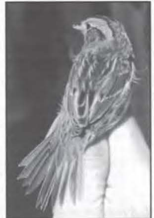
A nice in-the-hand view of one of the Gordon Park impoundment, Cuyahoga Co., Nelson's sharp-tailed sparrows. Photo by Sean Zadar on 14 October 2000.

Red Crossbill: One report, of ten passing over Springville Marsh, Seneca, on 4 Nov (T. Bartlett). No sightings of white-winged crossbills came to light, and their numbers in areas north of Ohio were reportedly down.