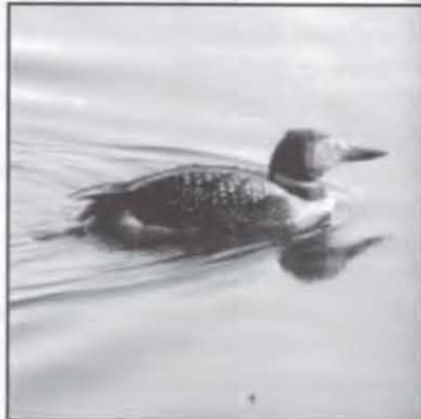
This injured adult common loon spent much of the summer and part of the fall at the E. 55th St. Marina in Cleveland, Cuyahoga Co. Photo by Paula Lozano on 9 September 2000.

American White Pelican: A. Blank 's bird of 23 Aug on the Crane Creek estuary stayed just long enough for A. Osborn to find it the following day.