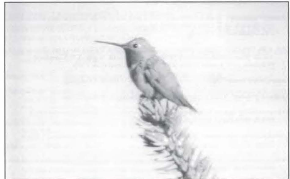
This adult male rufous hummingbird graced a feeder in Wayne Co. from 6-13 September 2000. Su Snyder was able to obtain this documentary photo on 6 September by holding a camera up to the eyepiece of a spotting scope.

Rufous Hummingbird: An adult male came to a feeder in Wayne from 6 to 13 Sept, where it was photographed and written up by S. Snyder; the record was accepted by the OBRC.