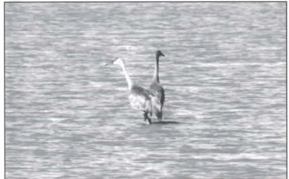
Killdeer Plains Wildlife Area, Wyandot Co., played host to an apparent nesting pair of sandhill cranes this year.