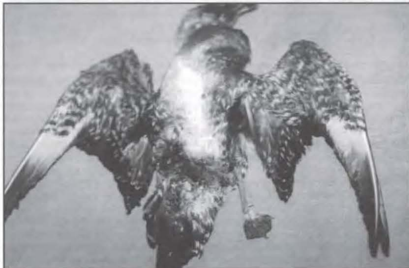
Sometimes it pays to investigate roadkill. Dan Sanders and Don Burton did just that and scraped this juvenile long-tailed jaeger off a Lake Co. road on 11 October 2000. Head detail, top left; undertail detail, top right; whole bird (ventral view), bottom.

Laughing Gull: Three first-year birds were seen. L. Yoder found one at HBSP on 19 Aug. A bird was intermittently reported at Grand Lk St Marys from 9 Sept ( C. Mathena ) all the way through 31 Oct ( J. McCormac , B. Master ). Another was on the beach at Caesar Ck SP from 30 Sept through 1 Oct ( L. Gara ).