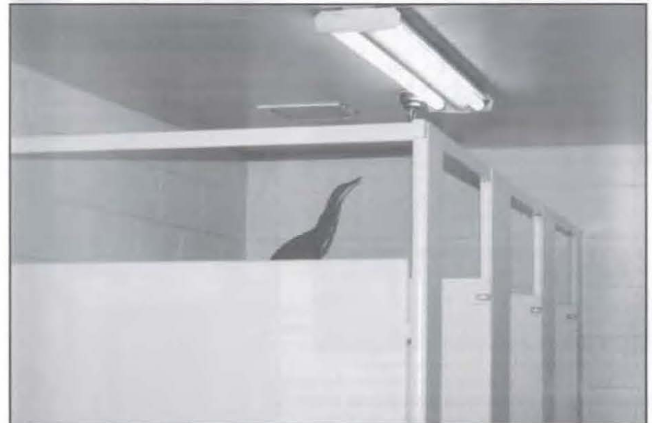
This peeping Tom/Tonya of an American bittern was found in the men's restroom at one of the Port of Cleveland, Cuyahoga Co., warehouses on 21 September 2000.