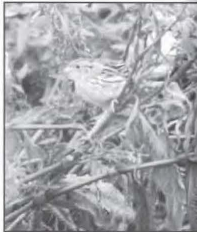
This adult Le Conte's sparrow at the Gordon Park impoundment, Cuyahoga Co., provided excellent looks on 16 October 2000.