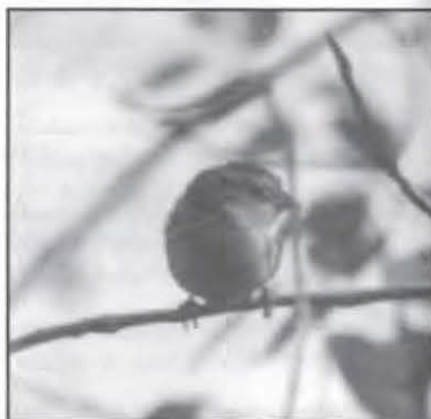
Another adult Le Conte's sparrow was found in Mentor, Lake Co., on 28 October 2000.