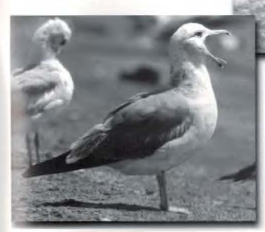
California Gull - Caesar Creek State Park, Warren Co., 15 May 2000.