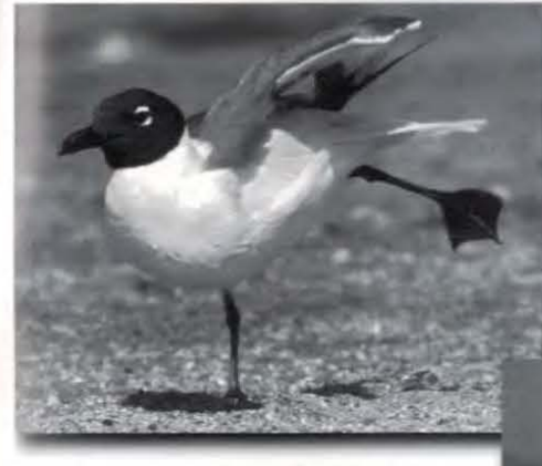
Laughing Gull - Caesar Creek State Park, Warren Co., 15 May 2000.