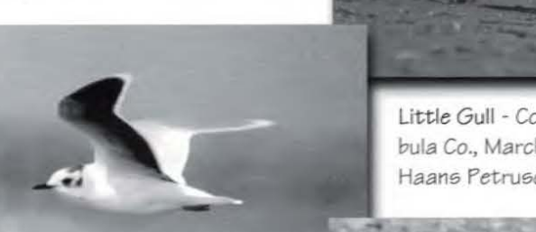
Little Gull - Conneaut Harbor, Ashtabula Co., March 2000.