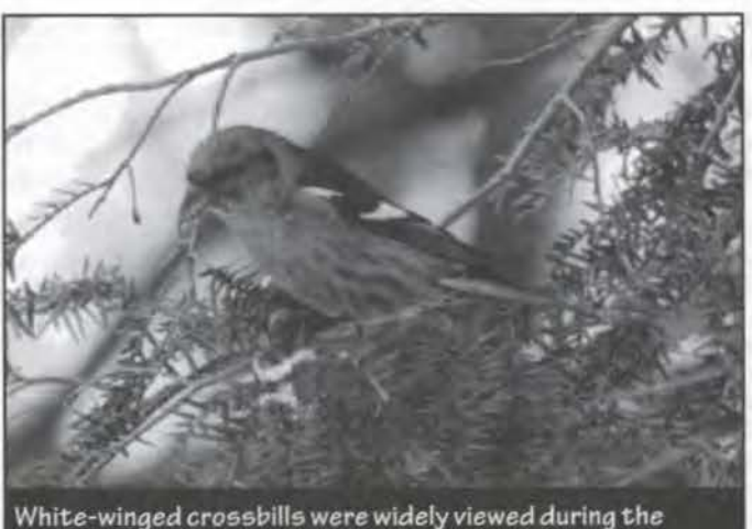
White-winged crossbills were widely viewed during the Winter 1997-98 season. This male was photographed in Toledo, Lucas Co., in January 1998.