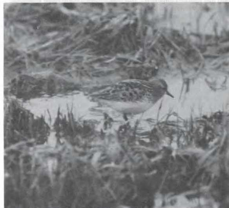
Another 1996 record from Gambell, Alaska-- a breeding-plumaged Red-necked Stint, Remarkably, there is one Ohio record for this species, also a breeding-plumaged bird, in Ashtabula Co. 7/21-22/62. It can happen!