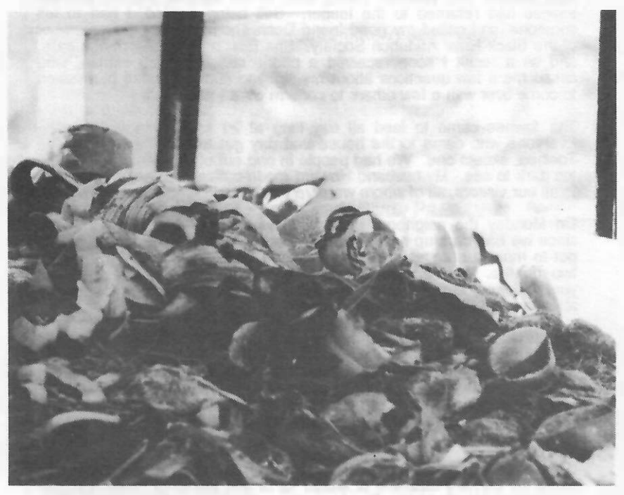
Yellow-throated Warbler. Holmes Co. February 2, 1993.