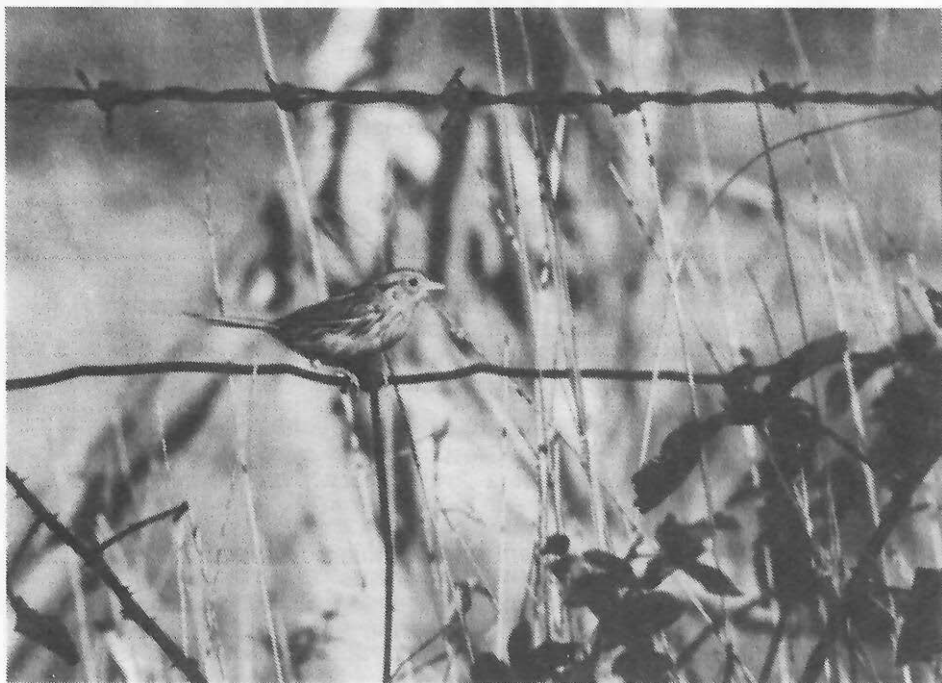
LeConte's Sparrow. Holmes Co., October 20, 1991