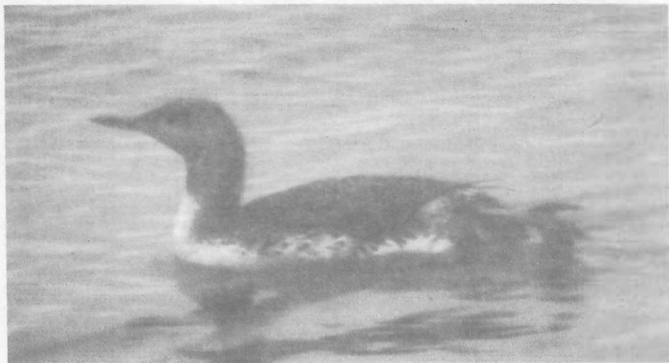
Red-throated loon (same individual as cover), 30 November 1988, Headlands Beach State Park, Photograph by Tom LePage.