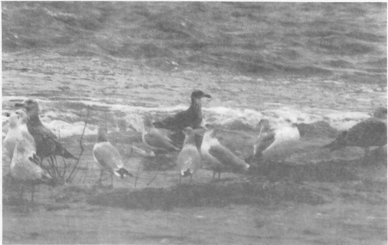
Second year Lesser Black-backed gull with Herring and Ring-billed gulls, Maumee River Rapids, Lucas Co.. 19 November 1988. This bird was apparently present about four months and may be the first Ohio record away from L. Erie.

In the following species accounts, unusual species are underlined and an asterisk following a sighting indicates a documentation accepted by the records committee. A 'D' indicates species which should be documented. Commonly used abbreviations are ONWR (Ottawa National Wildlife Refuge), CPNWR (Cedar Point National Wildlife Refuge), GLSM (Grand Lake St. Mary's), and CVNRA (Cuyahoga Valley National Recreation Area).