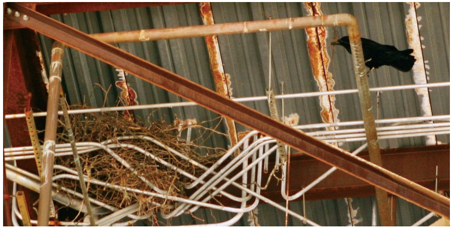
Figure 1. Common Raven nest during construction at Bristol Motor Speedway, Sullivan County, Tennessee.