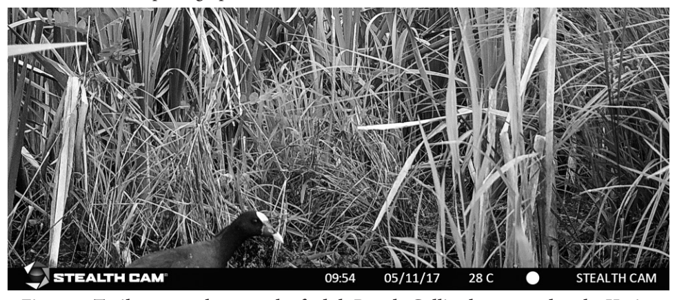
Figure 1. Trail camera photograph of adult Purple Gallinule captured at the Heritage Center Greenway Powerhouse Trail, Roane County, 11 May 2017.

Purple Gallinule is the 232<sup>nd</sup> bird species to be recorded on the U.S. Department of Energy (DOE) Oak Ridge Reservation (ORR) since 1950. Two hundred twenty-eight species were documented on the ORR by Roy et al. (2014). Since that time, Cackling Goose ( Branta hutchinsii , 25 November 2014), Wood Stork ( Mycteria americana , 13 August 2016), American Bittern ( Botaurus lentiginosus , 19 April 2017) and Purple Gallinule (11 May 2017) have all been photographed on the ORR.