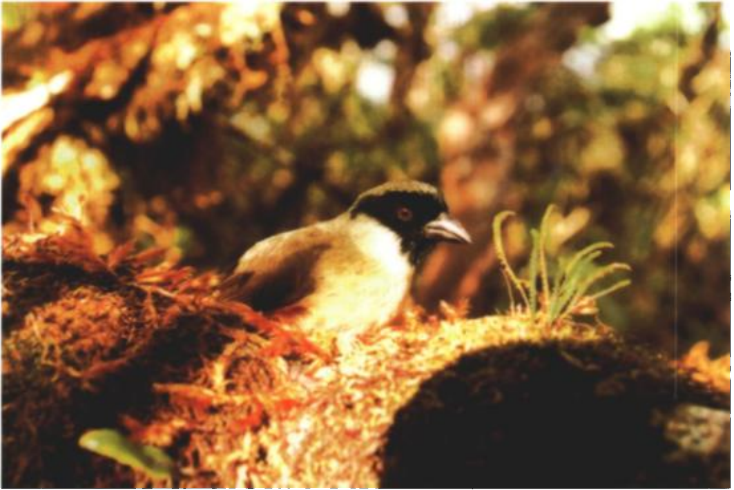
FIGURE 1. Adult male Po'ouli in the Hanawā Natural Area Reserve in 1997.

ceus ) and Maui Nukupu'u ( Hemignathus lucidus affinis ) were to be included in the project if encountered. Objectives of the plan were to (1) locate (by surveys) and continuously monitor all remaining individuals through banding and observation of known birds; (2) investigate the population ecology of the bird, abundance and diversity of invertebrate food resources, and effects of avian diseases on the population; and (3) control small, nonnative mammalian predators in Po'ouli home ranges by means of approved techniques. Consequently, U.S. Geological Survey was contracted for two years (1995–1997) to conduct the work. This paper reports the results of the primary goal of the project, namely the intensive search of the historical distribution of the Po'ouli and nearby areas to determine the current distribution and number of birds.