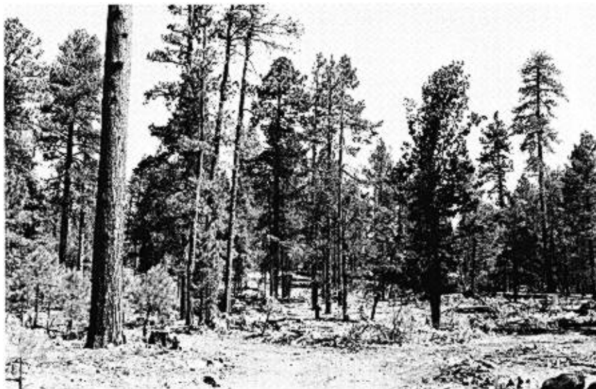
FIGURE 3. Silviculturally cut plot. Note the openings created by treatment.

The treatment in April 1974 reduced ponderosa pine by 55 trees/ha of 20% whereas gambel oak was reduced by 2 trees/ha or 10% (Table 1, Fig. 3). There were approximately 236 trees/ha with a canopy volume of 17,039 m 3 /ha. This