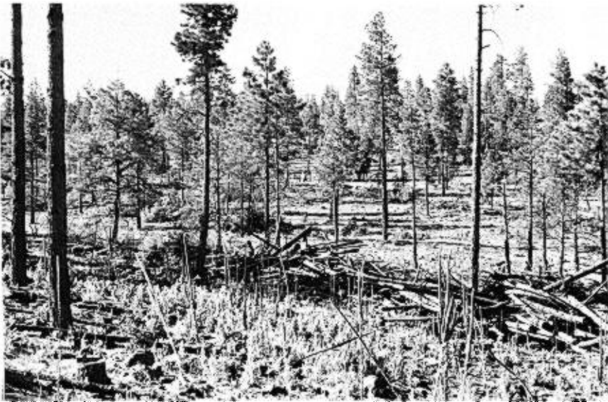
FIGURE 5. Severely thinned plot. Note the slash windrows and uniform thinning of this area.

The treatment was designed to test the effects of clear cutting all the woody