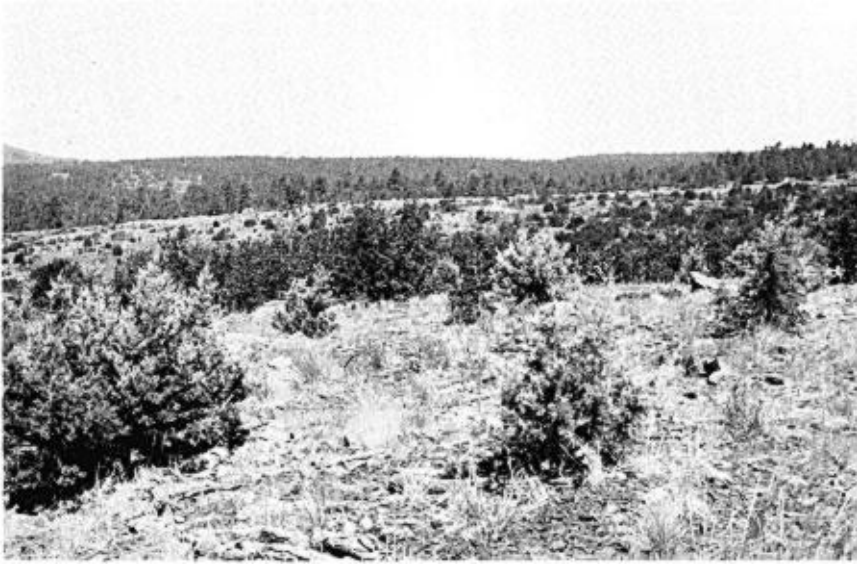
FIGURE 6. Clear cut plot. Note the growth of gambel oak sprouts which obscure the windrows.

vegetation on the watershed and windrowing the resultant slash (H. E. Brown, unpublished data). All wood products that could be sold were removed from the watershed. The remaining slash and debris were machine windrowed in such a way as to trap and retain snow, reduce evapotranspiration losses, and increase the drainage efficiency of the watershed. In areas of heavy slash the windrows were at least 1.5 m high and were spaced about 30 m apart. In areas of lighter slash the windrows were spaced further apart in order to achieve the minimum height. Windrows were placed in either an east-west or northeast-southwest direction.