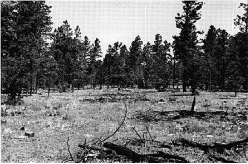
FIGURE 4. Strip cut plot. Note the open strip area.