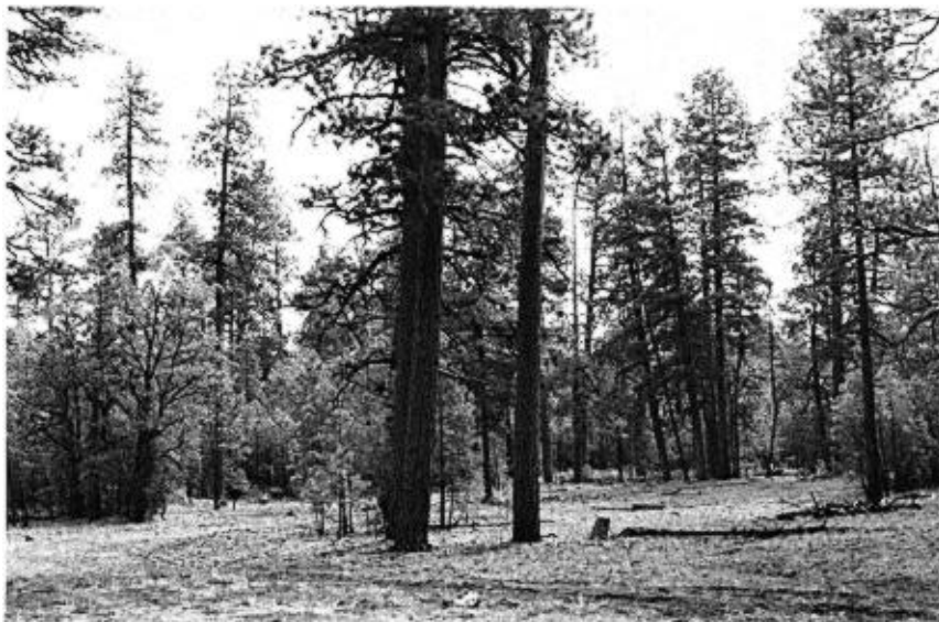
FIGURE 2. Control plot. Note the large trees and dense thickets.

m. The bulge area, between 4 and 20 m, encompassed 76.6% of the foliage volume on the study area.