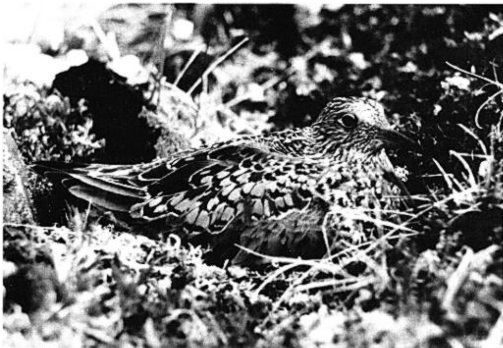
Surfbird ( Aphriza virgata), Mt McKinley National Park, Alaska, 13 June 1978