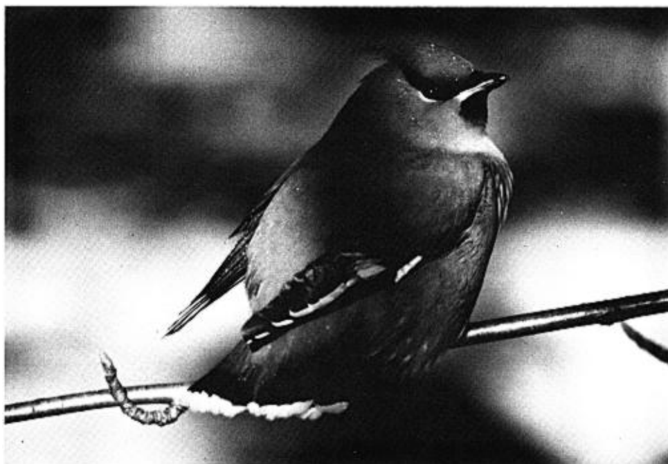
Bohemian Waxwing ( Bombycilla garrulus), Juneau, Alaska, December 1977