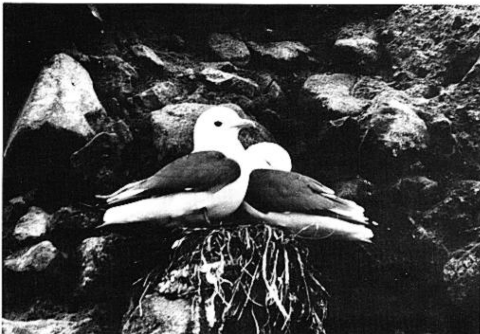
Red-legged Kittiwake ( Rissa brevirostris ), Buldir Island, Aleutian Islands, Alaska, 2 June 1977, E. P. Knudtson.