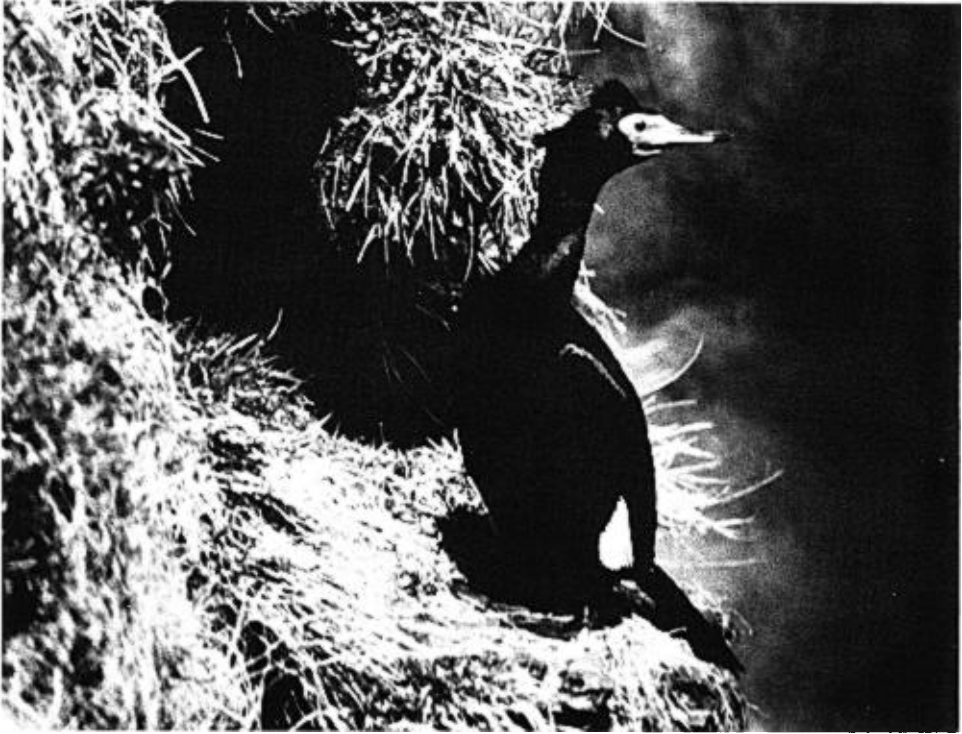
Red-faced Cormorant ( Phalacrocorax urile ), Agattu Island, Aleutian Islands, Alaska, 17 May 1977, R. H. Day.