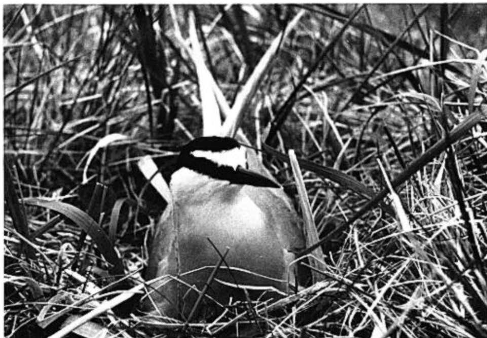
Aleutian Tern ( Sterna aleutica ), Umnak Island, Aleutian Islands, Alaska, July 1962, R. T. Wallen.