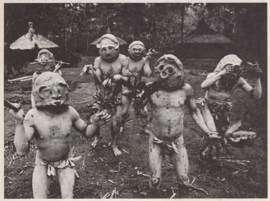
The Mudmen of the Asaro River.