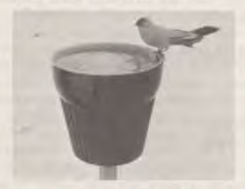
BLUE BIRD INDUSTRIES