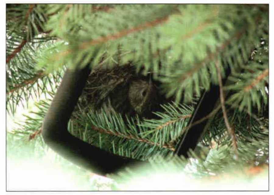
Figure 1: Adult Pine Siskin in the nest.

SIMPSON, M.B., Jr. 1993. Pine Siskin nesting in the southern Blue Ridge Mountain province. Chat 57:47-49.