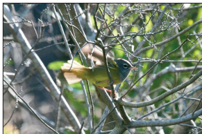
MacGillivray's Warbler, Chatham Co., 8 April, by Russ Wigh

MACGILLIVRAY'S WARBLER - A female was seen on Skidaway Island, Chatham Co., on 8 April (ph., Russ Wigh, pending, GCRC 2012-42).