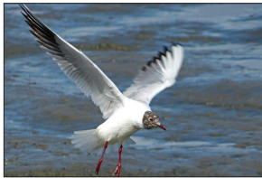
Black-headed Gull, Chatham Co., 8 March

BLACK-HEADED GULL - The wintering adult was present at the Frank Spencer Boat Ramp, Chatham Co., until 18 March, by which date it had acquired its black hood (m. ob., GCRC 2012-05).