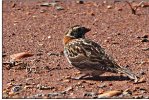
Lapland Longspur, Bartow Co., 3 March

LAPLAND LONGSPUR - Three were found in Sam Smith Park, Bartow Co., on 3 March (ph., Gene Koziara, GCRC 2012-08).