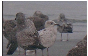
Iceland Gull, Camden Co., 18 December