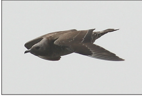
Parasitic Jaeger, Glynn Co., 17 January