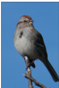
American Tree Sparrow, Murray Co., 16 January