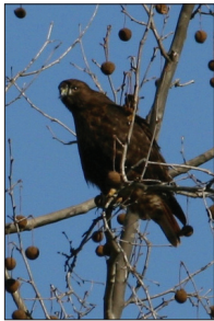
Western Red-tailed Hawk, Forsyth Co., 6 February