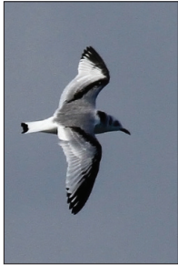
Black-legged Kittiwake, Troup Co., 7 February

BLACK-LEGGED KITTIWAKE - One was located at WPD, an excellent inland find, on 26 January (Walt Chambers, GCRC 2011-19), and stayed until at least 27 February (m. ob.).