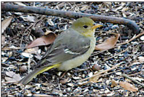
Western Tanager, Skidaway Island, 8 February

WESTERN TANAGER - A female was discovered coming to feeders at a residence on Skidaway Island, Chatham Co., on 7 February, and was present as late as 16 February (Ann Fenstermacher).