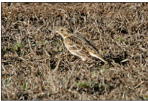
photo NAB Vol. 62, pg. 228). The bird was re-located by m. ob. as late as 13 January.

SMITH’S LONGSPUR - This species was discovered on 24 December at MSS, for a first Georgia record (Walt Chambers; accepted, GCRC 2008-19A;