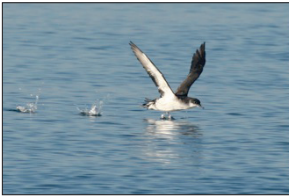
Manx Shearwater, Atlantic Ocean, 9 December

MANX SHEARWATER - A new state high count of 10 birds was made on a pelagic birding trip off Tybee Island on 9 December (Bob Zaremba et al.; pending, GCRC 2009-11). This species is listed in the most recent ACOGB (2003) as an accidental fall and winter visitor to offshore zones. Data gathered from the growing number of sea-birding expeditions over the past 5 years, along with more observers learning how to accurately identify this species (vs. the similar Audubon's Shearwater), support the assertion that its status in the state may now be considered rare to uncommon in winter. The species has been consistently recorded on Georgia winter pelagic birding trips, including counts of 6 on 21 February 2003, 3 on 11 January 2005, 2 on 12 February 2005, and 3 on 14 January 2007.