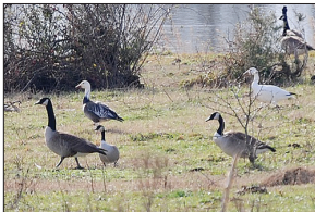
From left: Canada Goose, “Blue Phase” Snow Goose (background), Cackling Goose, Canada Goose, “White Phase” Snow Goose, Gordon Co., 29 December, by Joshua Spence

CAKCLING GOOSE - A single bird was found with a group of Canada Geese and 2 Snow Geese on PCR on 29 December (Joshua Spence; accepted, GCRC 2008-03) and was re-located by v. ob. the following day.