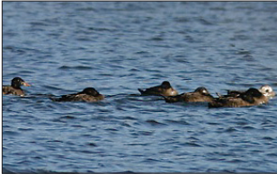
From right: Long-tailed Duck, 2 White-winged Scoters, Black Scoter, 2 White-winged Scoters, Surf Scoter, Barrow Co., 21 January, by Brandon Best

LONG-TAILED DUCK - On 21 January, a remarkable group of sea ducks was discovered on the small lake at Ft. Yargo State Park in Barrow Co. (Brandon Best). The group contained a single Long-tailed Duck among three species of scoter.