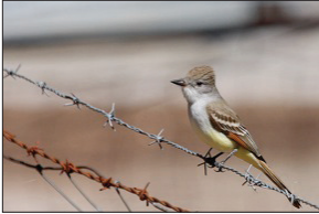
Ash-throated Flycatcher, Baker Co., 20 February, by Darlene Moore

(Zaroga Goff; accepted, GCRC 2008-20; photo NAB Vol. 62, pg. 228), and was re-located by v. ob. until as late as 23 February.